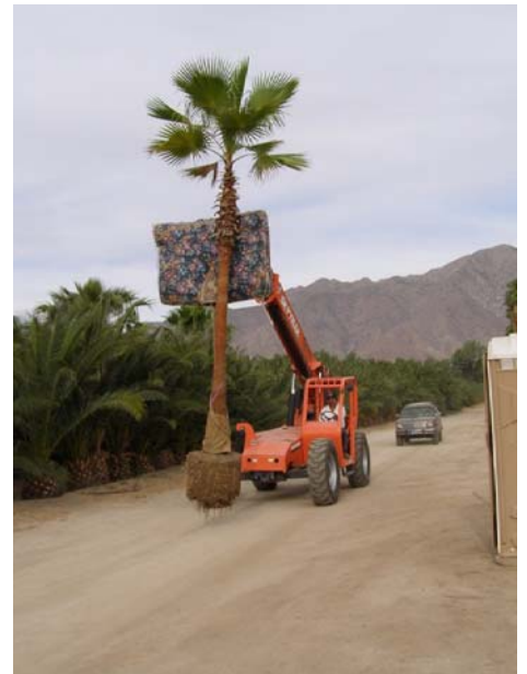
Newly dug and skinned 18 ft. CTF Washingtonia Robusta though "Pecoff's Borrego Palm Farm"