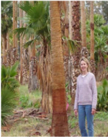
Skinned Washingtonia Fan Palms