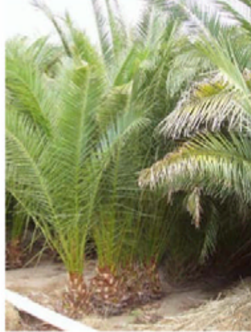
2 foot Clear Trunk Trimmed Palms