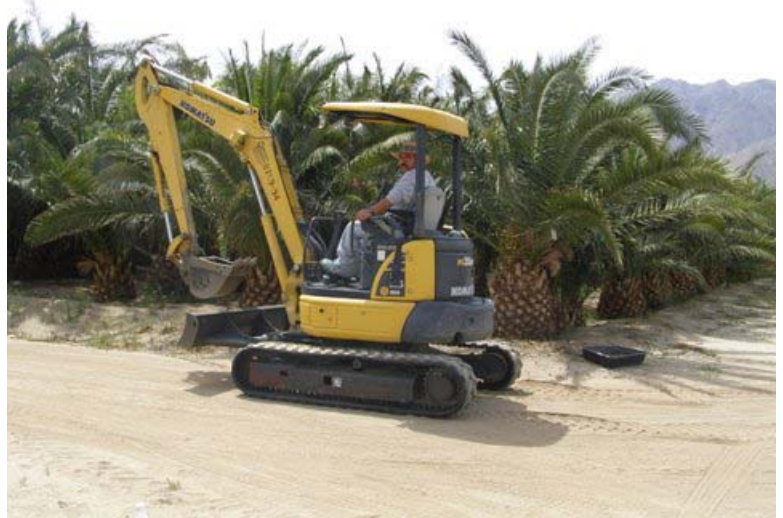
Row production Phoenix Canarienses at Pecoff's Borrego Farm