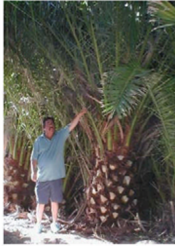
3.5 foot Clear Trunk Palms