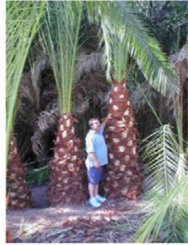
8 foot Clear Trunk Canary Palms