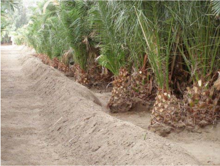
3ft to 5ft trimmed-trunk Phoenix Canarienses