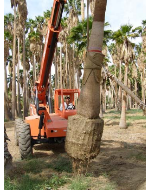
18' CTF Washingtonia Robusta, skinned and dug, ready for B&B