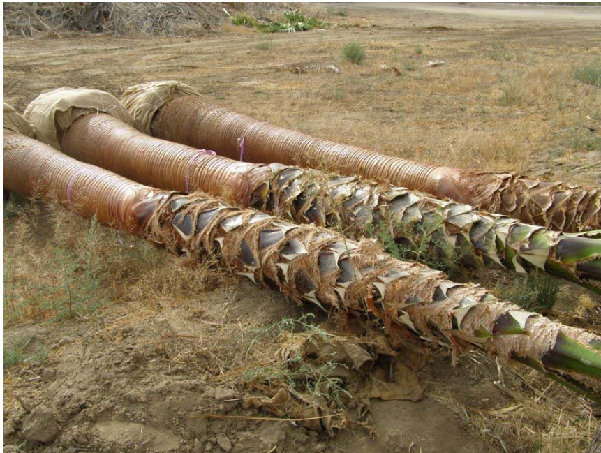
15' - 18' CTF Washingtonia Robusta skinned, ready to be loaded for transport