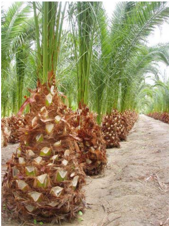
4ft to 6ft trimmed Phoenix Canarienses Palms