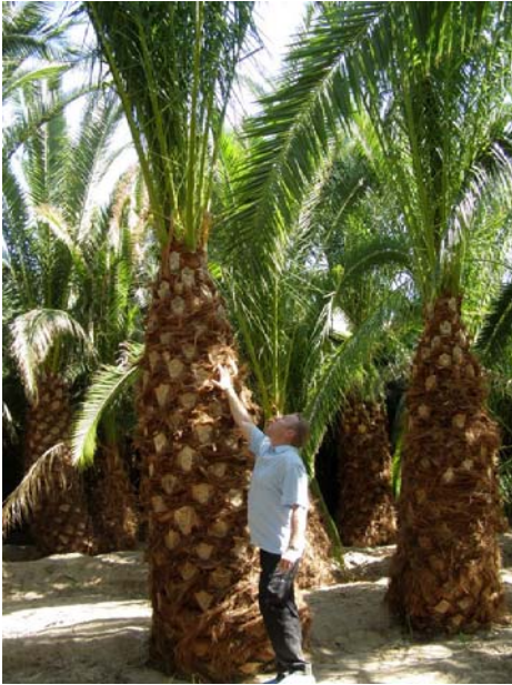
10' CTF Phoenix Canariensis trimmed but not skinned or pineappled