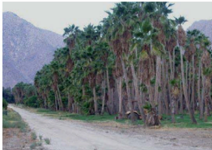
Specimen "Skinned" Washingtonia Robusta Palms