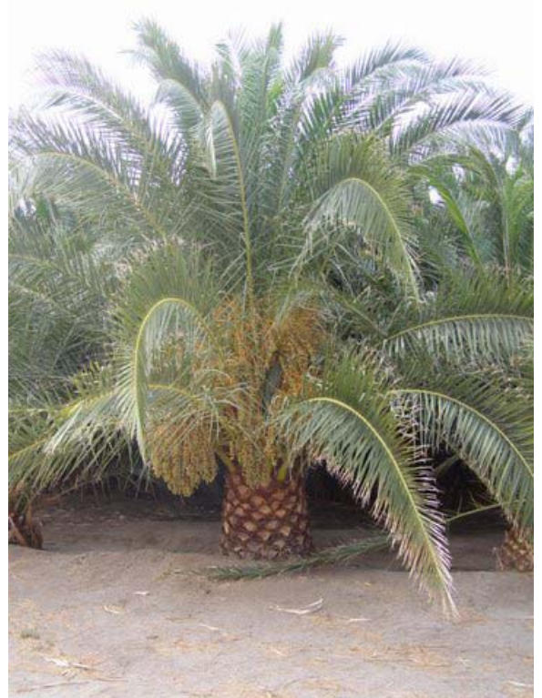
European "Cut" Phoenix Canarienses