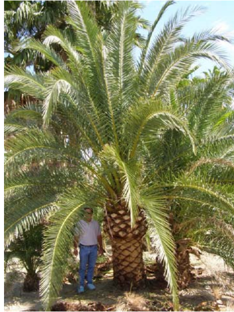
7.5' CTF Phoenix Canariensis skinned with pineapple head and lower thorns removed