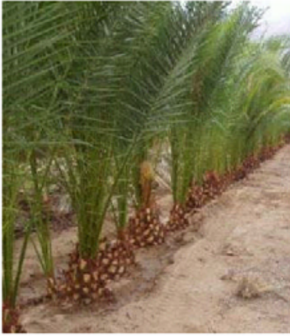
18" Clear Trunk Canary Island Canariensis Palms