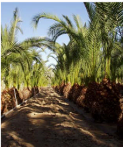
3 ft to 5 ft trimmed Canary Island Palms