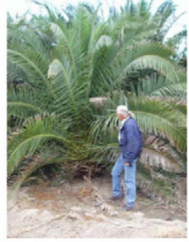
Untrimmed Canariensis Palms